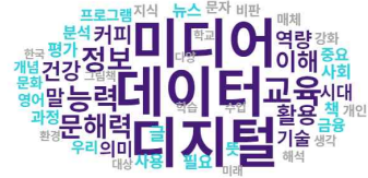
[Word Cloud: Top 50 Keywords]