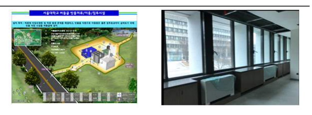
tatus of the installation of large capacity green rainwater storage facilities Building