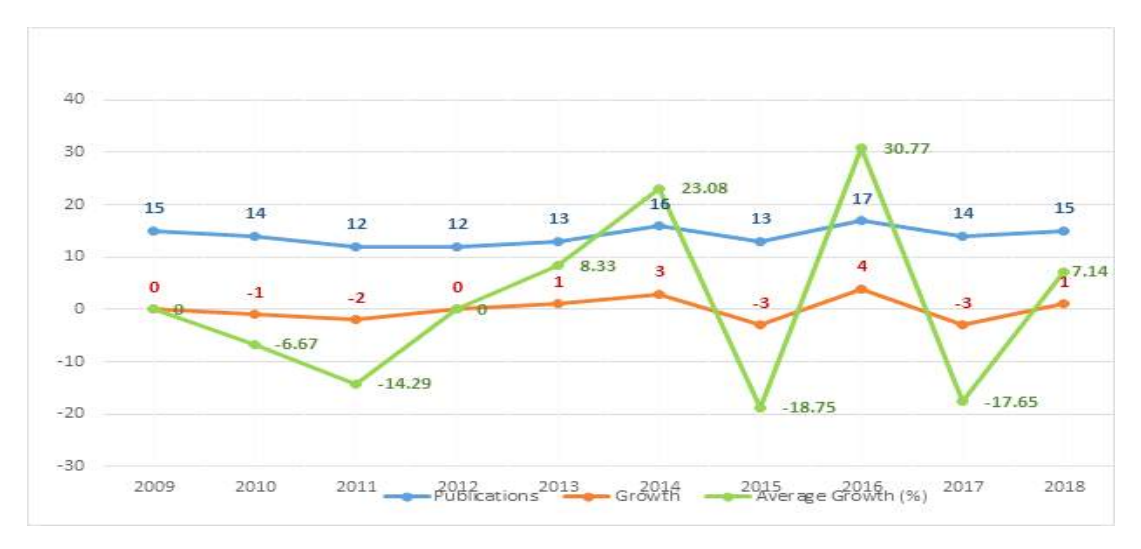
Fig. 1. Year- wise growth of research articles published in AJLAIS