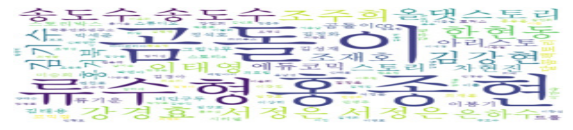
Fig. 5. Word Cloud of Names of Authors of Most Borrowed Children's Books