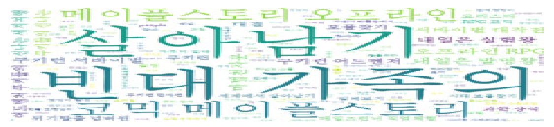
Fig. 3. Word Cloud of Names of Most Borrowed Children's Books