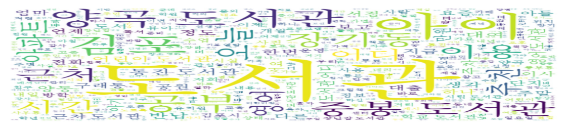
Fig. 7. Word Cloud of Search Results in 2014 ~ 2018