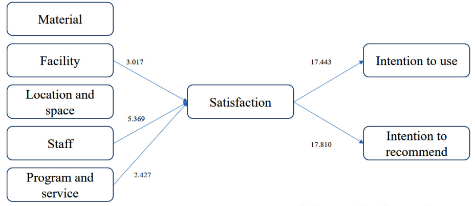
Hypothesis accepted based on CR value